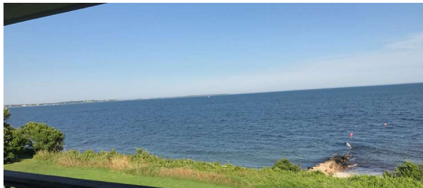
MORE WIANNO PHOTOS CLOCKWISE FROM MIDDLE LEFT Exterior Beach Cottage Interior Beach Cottage Room Ocean View Bathroom Exterior Putting Green Cottage Wianno Golf Course Beach Cottage Balcony View of Nantucket Sound